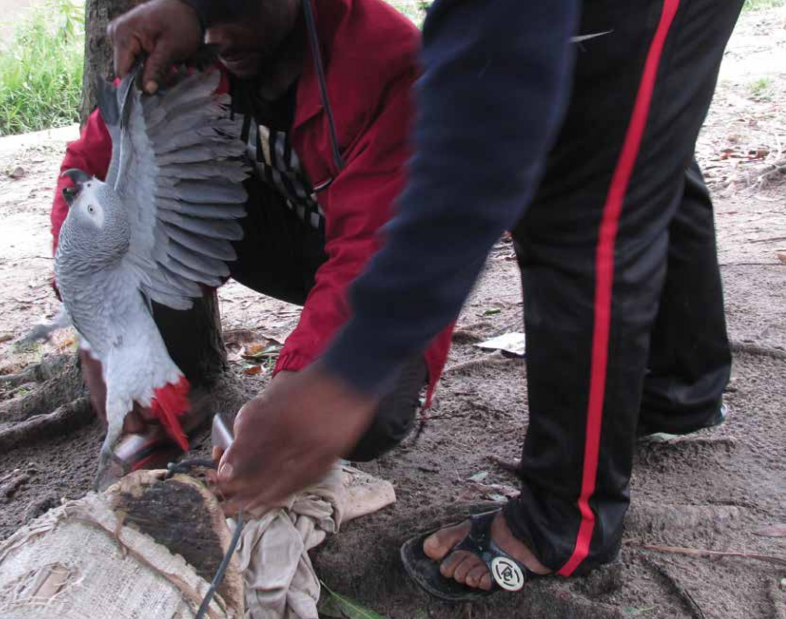
Image: Captured grey parrots being put in a basket for transport to market.