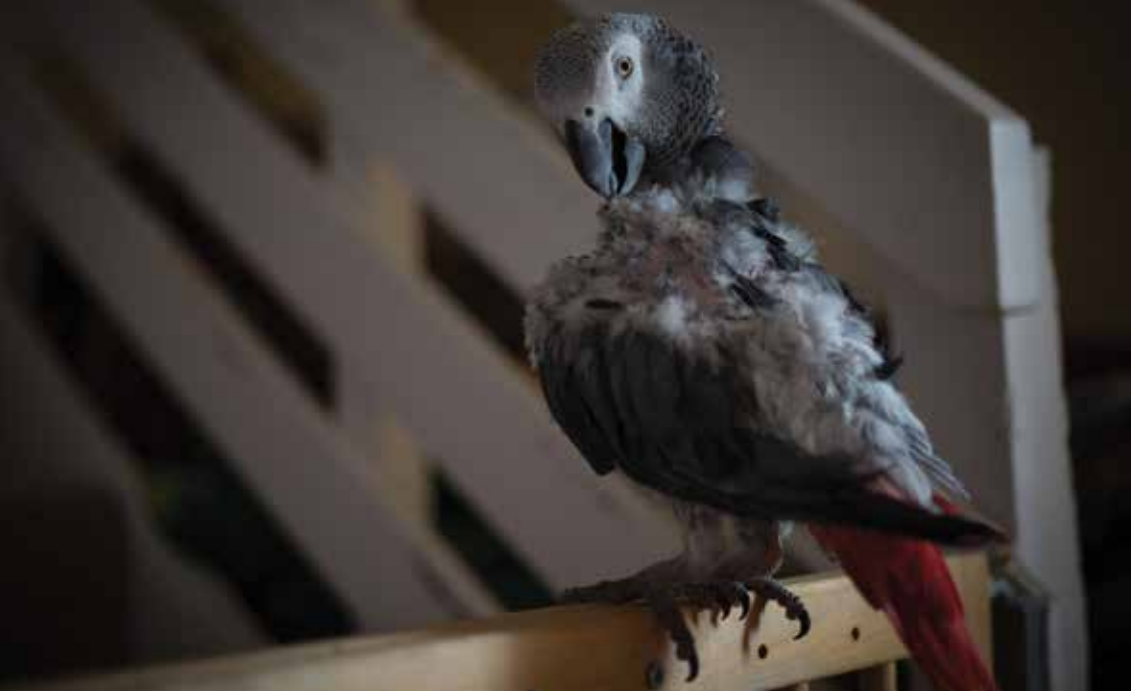
Left: An African grey parrot with a behavioural feather-plucking problem, a result of suffering in captivity.