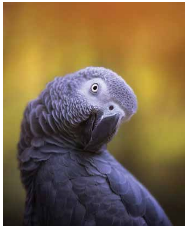
Below: An African grey parrot in the wild.

We are engaging corporate stakeholders in the industry - both the transportation industry, such as airlines and shipping companies and on the ground - retailers outlets like pet stores and online platforms that support the trade in wild animals across identified consumer countries (US, Canada, Netherlands, China and United Kingdom) to inspire their awareness of the animal impact of the exotic pet trade and support the campaign.