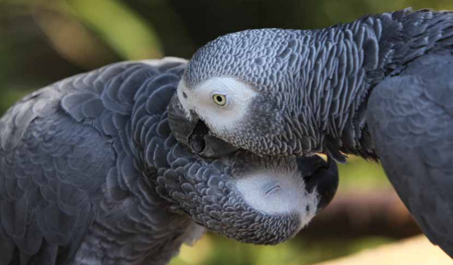
Image: Wild African grey parrots are highly social and nest in large groups, containing up to 10,000 individuals, comprising of small family groups.