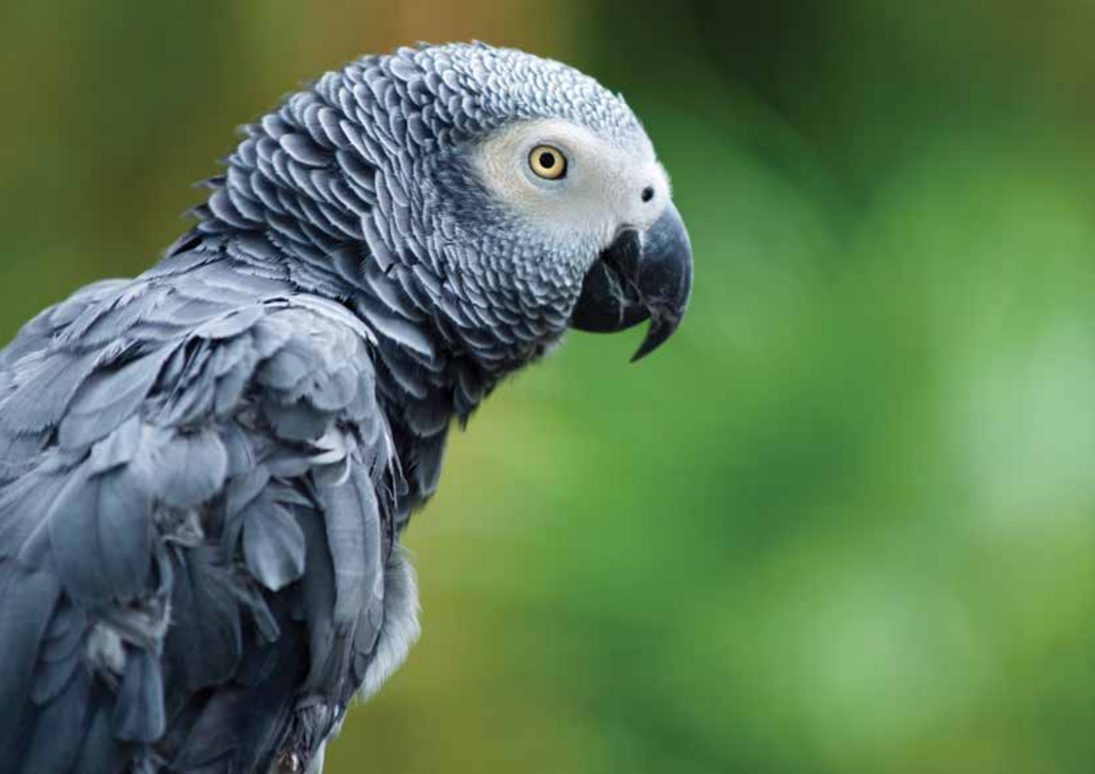
Above: An African grey parrot in the wild.