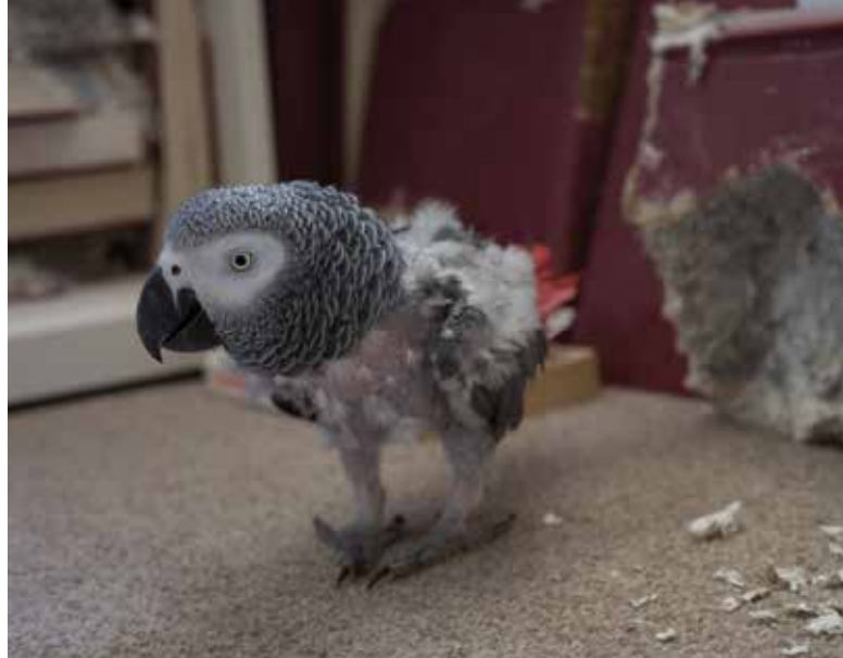
Above: Stress caused by captivity can lead to abnormal behaviours in African grey parrots, like feather plucking.

In captivity, African grey parrots have been taught to perform tasks that were once thought to be unique to humans and non-human primates. Their intelligence is yet another reason that a life in captivity is cruel. These birds need stimulation and activity to match their intelligence, yet pet-owners are rarely informed about how to care for the minds and bodies of these beautiful, social, intelligent animals.