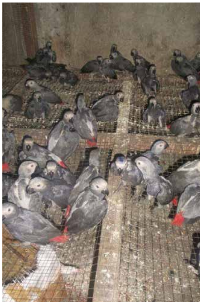
Above: African grey parrots during transportation.

World Animal Protection is calling on Turkish Airlines to stop transporting all birds, until it's sure African grey parrots and other protected species aren't being flown illegally on its planes.