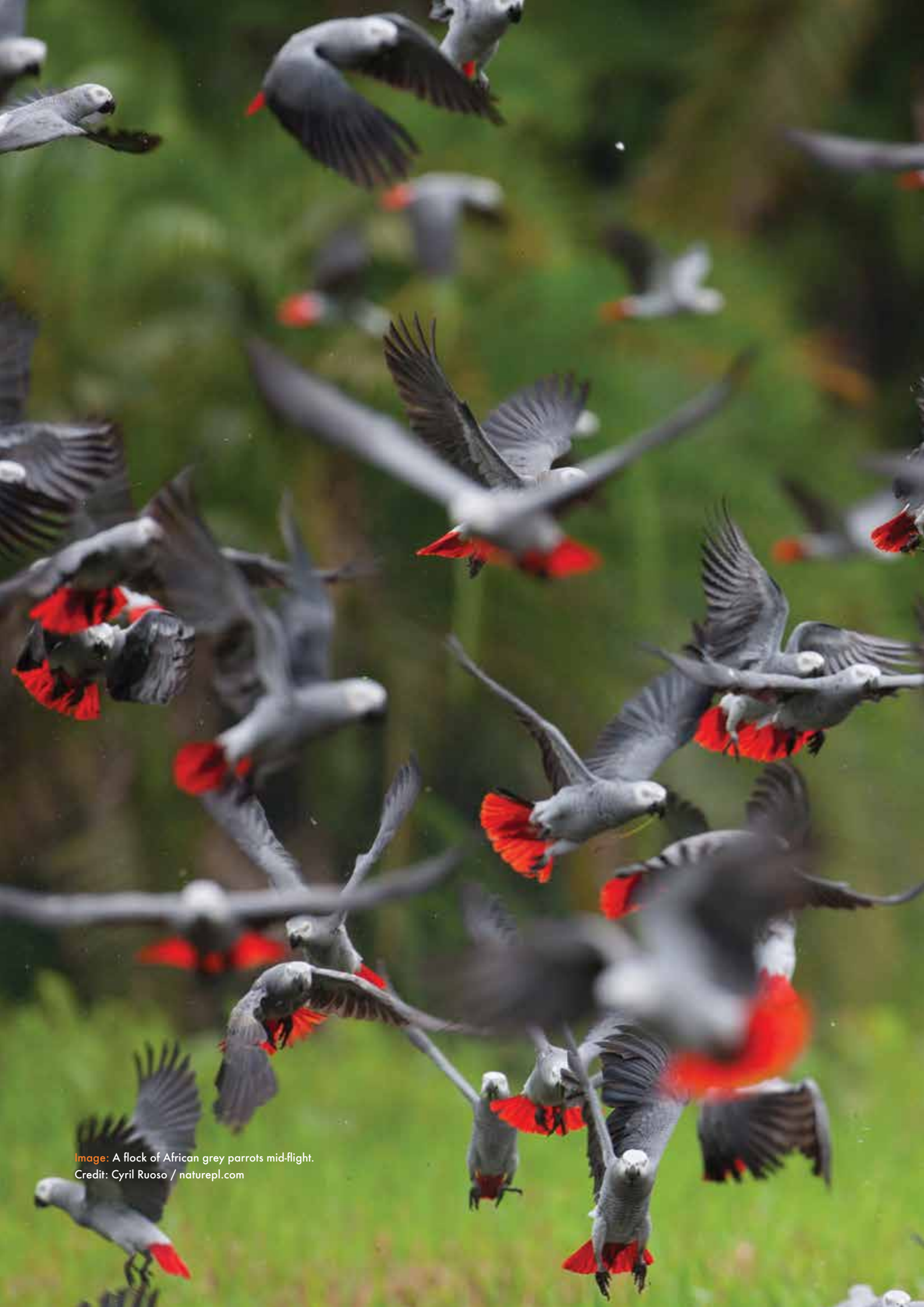
Image: A flock of African grey parrots mid-flight.