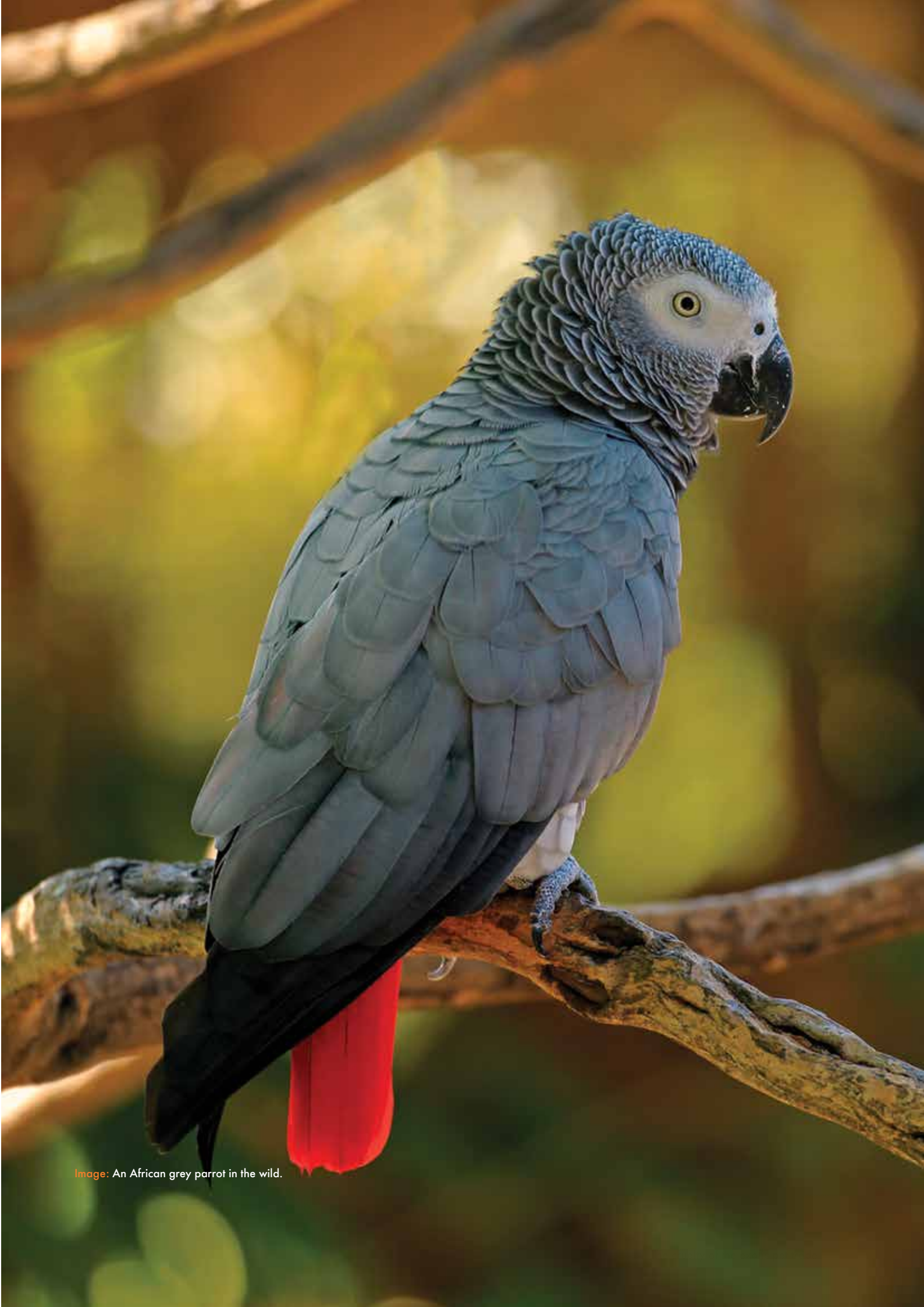
Image: An African grey parrot in the wild.