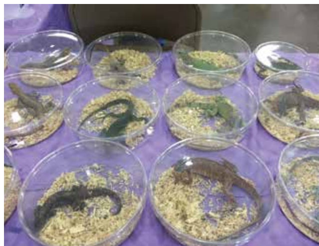
Below: Iguanas for sale at a pet expo.

There is no aspect of the exotic pet trade that is free from suffering. Ultimately that’s because these animals are not meant to be pets, and therefore no amount of love, affection and quality care can ever make up for the harm that is inherent in the trade.