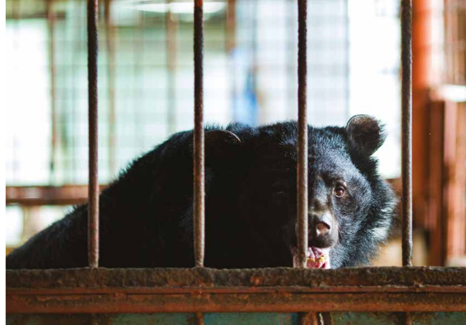
Image right: Bears held in captivity endure years of pain and suffering. This is one such bear who suffered for more than 13 years in Vietnam's Tieng Giang Province.