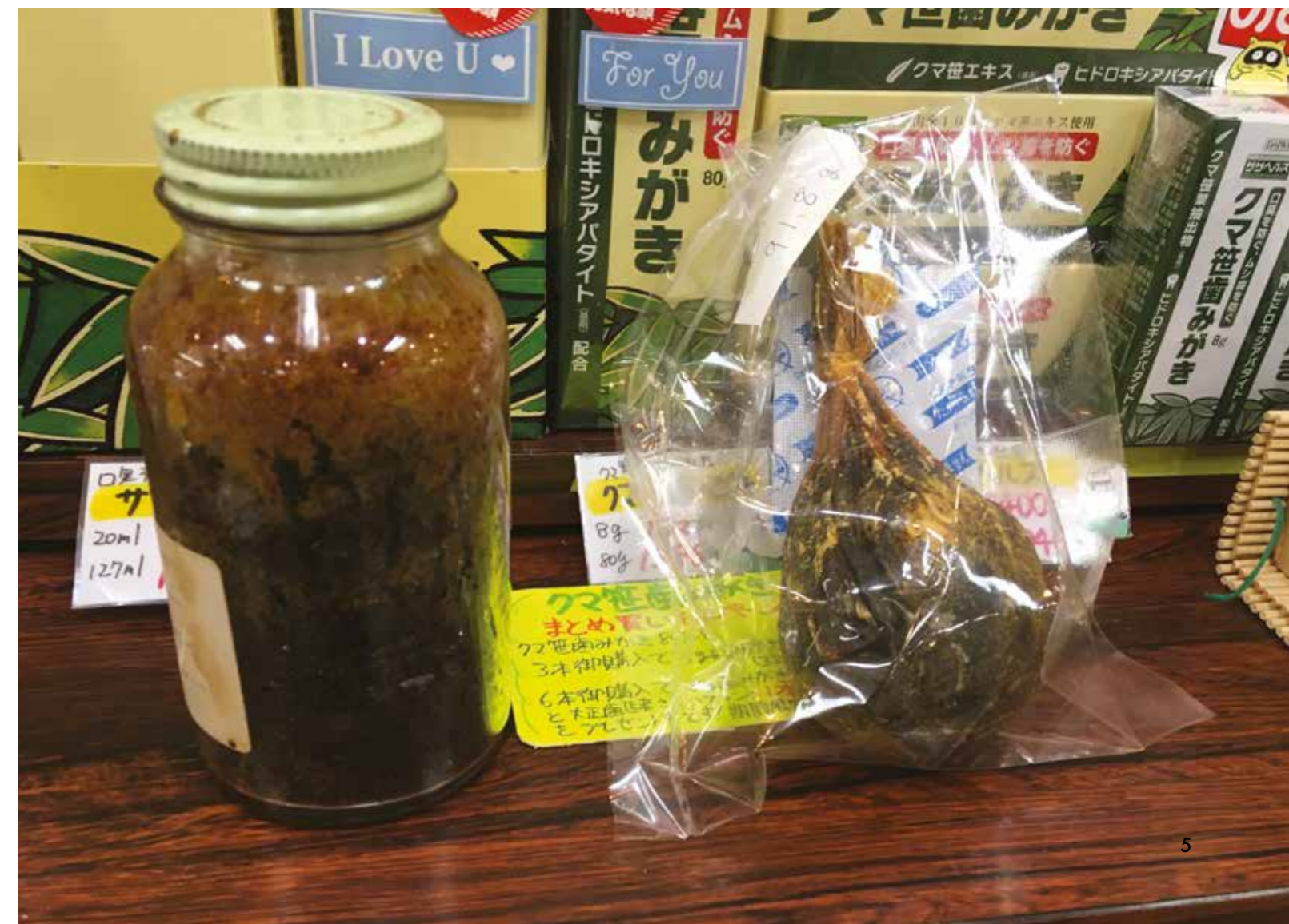
Image below: Bear gall bladder and unprocessed bear bile jar, imported from Hong Kong and sold in a pharmacy in Japan.

China has consistently been found to be the main source of most bear products in the international trade. According to the China Chamber of Health Products Commerce for Import and Export of Medicines, China exported $32,788,000 of TM to Japan in 2010; $27,381,00 to Hong Kong; $20,061,000 to United States; $14,486,000 to South Korea; $10,271,000 to Malaysia; $9,921,000 to Vietnam; $7,747,000 to India; $7,605,000 to Taiwan; $6,892,000 to Singapore; and $6,762,000 to Germany. 20