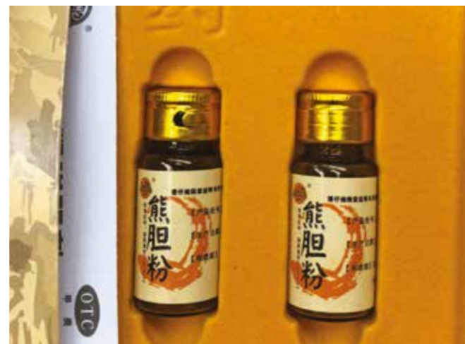
World Animal Protection carried out investigations in traditional medicine stores in Japan, US and the UK. In San Francisco, 15% of stores sell bear bile and when in powder form it sells for US$100 per gram.

According to INTERPOL, bear bile products smuggled on commercial flights are occasionally concealed in strong smelling foods such as coffee, or dipped in chocolate. 37 In some instances, traffickers of live bears in cross-border areas destined for bile extraction facilities have taken on the guise of circus troupes to evade suspicion. 38